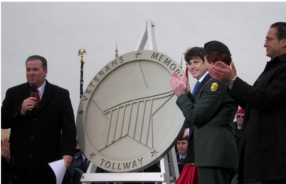
Dedication Ceremony – November 11, 2007 – featuring Governor Blagojevich

This event marked the first time that Will County provided recycling services to businesses and residents in a festival environment. While some residents expressed their satisfaction with being able to utilize ramp recycling containers so they could enjoy the festivities without carrying recyclables with them, others stopped at the Land Use booth to take batteries and eye glasses from bike pouches. All the containers were taken away by the early evening to allow for the official traffic opening that night. This was truly a unique and very successful event.