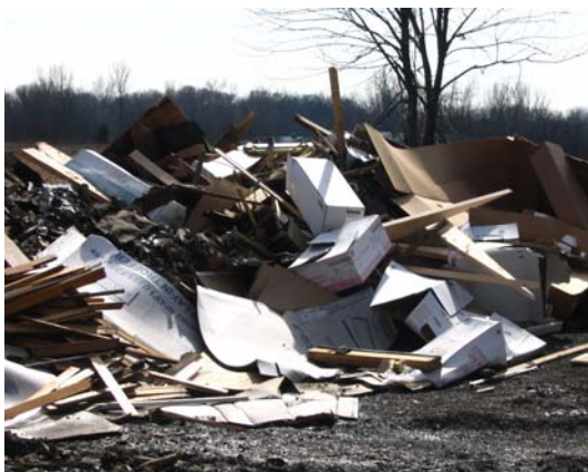
Example of illegal dumping complaint

In cases where the property owners or the responsible party did not comply, staff referred cases to the State’s Attorney’s office to pursue legal action. In 2007, 3,670 cubic yards of illegally dumped or burned material was legally disposed due to the Waste Service’s involvement.