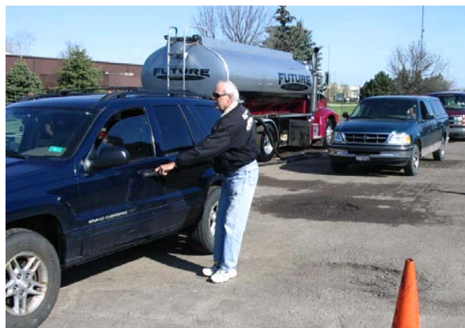
Future Environment Offers Free One-Day Motor Oil

Motor Oil Recycling: Although "Motor Oil" is part of the Household Hazardous Waste one-day and permanent collection programs. It is also accepted by a number of private companies throughout the year. In April 2007, one company, located in Mokena, volunteered to accept motor oil and antifreeze from residents without fees of any kind. A total of 49 participants dropped off 390 gallons of motor oil, 25 gallons of antifreeze and 15 oil filters at Future Environmental in honor of Earth Day. The County listed the company, its location and drop-off hours on advertising for all the Spring events, but the only staff time devoted to this one-day event, was checking to make certain it was running smoothly.