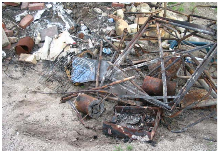
Example of illegal burning complaint photographed in 2007

When it was determined that violations were occurring, staff identified property owners and responsible parties, notified them of the violations and encouraged them to clean-up or cease illegal pollution causing activities. In 2007, 39 illegal dumpsites were brought into compliance.