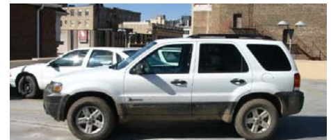
2007 Ford Escape Hybrid Inspection Vehicle Partially funded by IEPA Grant

Since 1988 Will County has had a Delegation Agreement with the Illinois Environmental Protection Agency (IEPA) to investigate citizen complaints about illegal dumping and/or garbage burning. This agreement improves response time to such complaints and has been successful in addressing issues in Will County's incorporated as well as unincorporated areas. The Delegation Agreement also requires inspections to be conducted at permitted pollution control facilities. In 2007 this agreement included a grant to cover approximately half the cost of a 2007 Ford Escape Hybrid to be used exclusively for inspections and related activities.