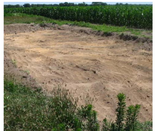
Clean up of former burning area

In cases where the property owners or the responsible party did not comply, staff referred cases to the State’s Attorney’s office to pursue legal action. In 2007, 3,670 cubic yards of illegally dumped or burned material was legally disposed due to the Waste Service’s involvement.