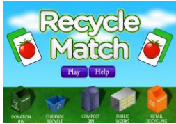
Play a fun game!