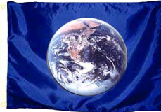
Join the School Earth Flag Program