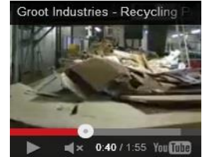
Virtual Tour Tour Recycling Sites