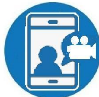
Take a Virtual Tour