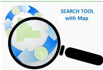
Search for recycling and disposal options on willcountygreen.com