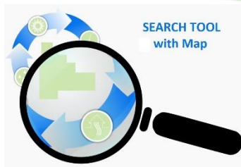
Search for recycling and disposal options on willcountygreen.com