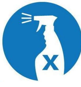
Household Hazardous Waste Drop-Offs