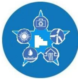
Green Business Star