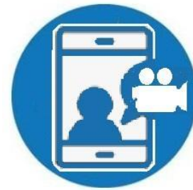
Take a Virtual Tour