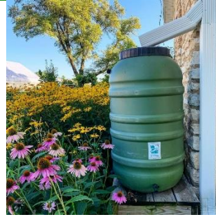
Rain Barrel $64.50

When ordering online, designate your preferred pick-up location.