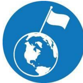
School Earth Flag