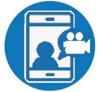
Take a Virtual Tour