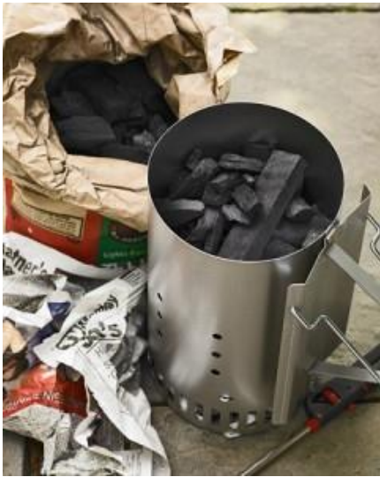
A Charcoal Chimney completely eliminates the need for hazardous starter fluid

Having friends or family over for a backyard party is an excellent summer activity. Please be sure to set out recycling containers so your guests know what to do with aluminum cans. Encourage them to bring refillable bottles or offer durable stainless steel or glassware that can be washed and reused. Consider options for reusable utensils, including purchasing extra from the thrift store. If using charcoal, skip the starter fluid altogether and use a charcoal chimney for heating up the charcoal quickly. If using disposable, choose paper plates that will break down in a compost or landfill instead of plastic that will last up to 1,000 years in an Illinois landfill. Parties can be fun for us and safer for the environment.