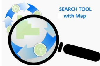
Search for recycling and disposal options on willcountygreen.com