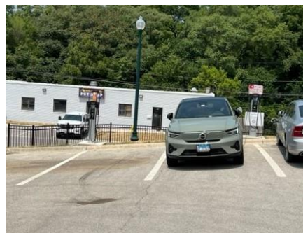
Two Stations, Four Plugs Free Charging in Lockport

The City of Lockport has installed a 2nd EV Charging Station in their downtown area at the City Hall, steps from the library and shopping district. After experiencing increasing use at the first station installed a couple of years ago with Will County contributing $3,500 towards the cost through their EV Charging Station grant fund. Lockport applied for a grant for a second station early this year and recently opened it to the public. They now have two stations serving four vehicles, offering free charging with a four hour limit to encourage employees and visitors to adopt plug-in vehicles and shop Lockport! Apply for your community.