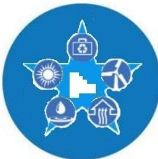
Green Business Star