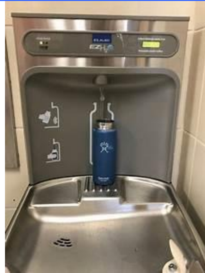
Will County Grant Info

The use of reusable water bottles was given a boost when SB 1715 was signed into law, requiring all new buildings over 5,000 square feet to have drinking fountains with a water bottle refilling option. This recognition of the need for waste reduction through the use of refillable containers also seems to acknowledge that while disposal bottles are recyclable, many people do not have access to recycling, resulting in 60 million plastic water bottles being thrown away each day in the USA. Please be aware that Will County offers schools, park districts and municipalities with park areas a grant to convert water fountains to refilling stations.