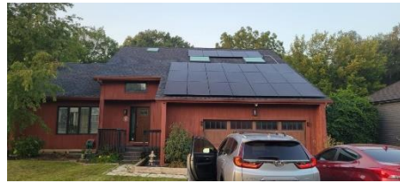
Visit a home in Bolingbrook with 26 Mounted Solar Panels (Found in the Northern Tour Area of the ISEA's website)

The Illinois Solar Education Association offers many resources to home owners and businesses interested in solar. Their 2023 Illinois Solar Tour will take place on Saturday, September 30th in a hybrid format! Home and business owners with renewable energy installations will be open to the public for the sharing of first hand knowledge and experience of owning, maintaining, and living with renewable energy. They will also have videos online. Learn more by clicking here .