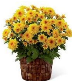
Pot Mum (needs sun)