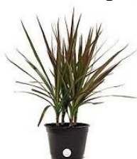
Dragon Tree (tolerates low light)