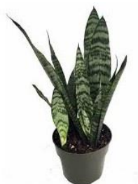
Mother-in-Law's Tongue (easy care)