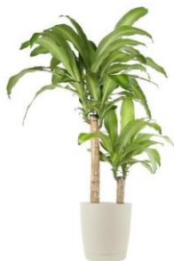
Mass Cane/Corn Plant (prefers humidity)