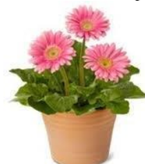
Gerbera Daisy (prefers warm temp)