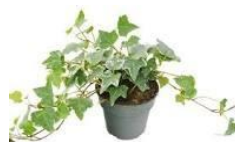
English Ivy (full shade to full sun)