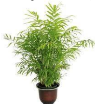
Bamboo Palm (prefers partial sun)