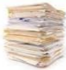
Office Paper & File Folders