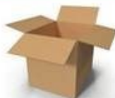
Cardboard (Flattened Boxes)