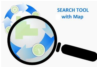
Search for recycling and disposal options on willcountygreen.com