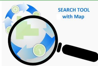
Search for recycling and disposal options on willcountygreen.com