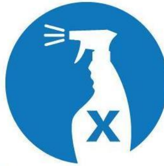
Household Hazardous Waste Drop-Offs