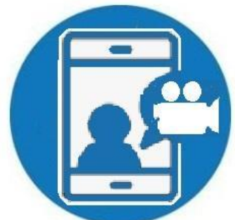
Take a Virtual Tour