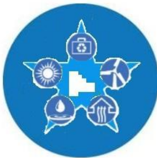
Green Business Star