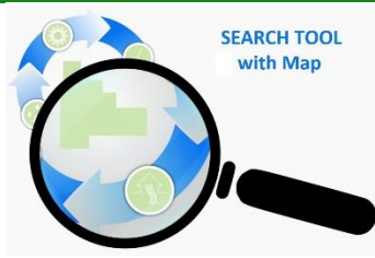
Search for recycling and disposal options on willcountygreen.com