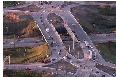
Photo from Divergent Diamond at Rt 59 & I-88

Confusing at first glance, studies have found the divergent diamond design for highway entrances are actually easy to use, reduce accidents, use less right-of-way than traditional designs and shorter cross walks for pedestrians. Basically, forcing drivers to switch sides, is better for the environment and safer for all concerned. Will County just had a divergent diamond completed at I-55 and Weber, with another two under construction at I-55 and Rt. 59; and at I-80 and Houbolt. All of these include enhancements for alternative transportation in the form of bicycles.