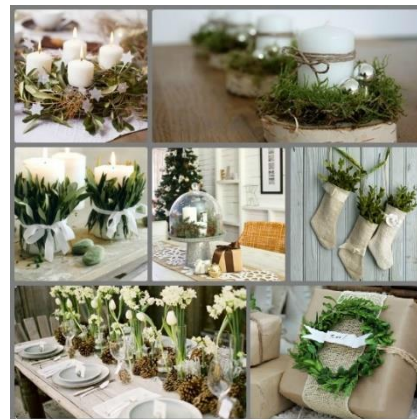
Thrift stores often offer inexpensive decorations, spare plates, utensils and even some gift items

Last month we offered information on meal planning to reduce food waste. This month, we are offering tips on decorating for reuse and recycling. String lights are festive and can be recycled if they fail to work. Paper and paperboard hats, centerpieces may be recyclable if they cannot be saved for reuse. No glitter or foil or feathers are acceptable. If you can decorate with natural items, such as pine cones and branches, these can be composted in the back yard afterwards. Some people place leftover grease and bird seed on them to feed the birds. The same can be done with a natural Christmas Tree. If your hauler takes it for chipping, be sure to