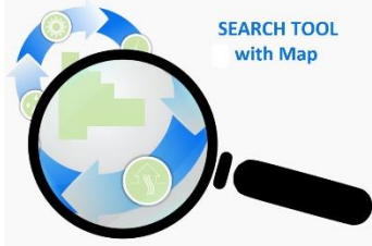
Search for recycling and disposal options on willcountygreen.com