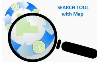
Search for recycling and disposal options on willcountygreen.com