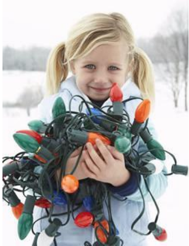
String Light Recycling Additional Sites December 1, 2022 - January 31, 2023 County Office Building, 302 N. Chicago St