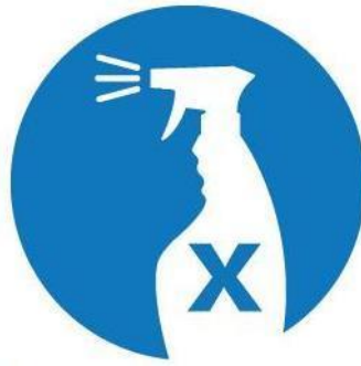
Household Hazardous Waste Drop-Offs