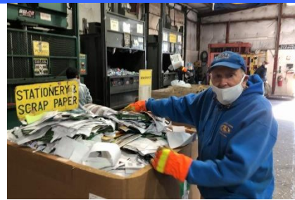
2022 Photo inside Crete Recycling Center

Since 1945, the Crete Lions Club has been operating a Recycling Drop-Off serving Will County residents and businesses. They are run with volunteer staff and the oldest, continuing operating recycling drop-off in Will County. Located at 1215 Douglas, next to the Public Works garage in Crete, they are open Monday thru Friday from 7 to 9 am, or Saturdays, from 7 am to noon. They take only items they can market so please check their website for the list. They also accept eyeglasses, a national Lions Club program. Will County offers Traditional Recycling Drop-Offs at six partnering locations: Braidwood, Channahon, Godley, Lockport, New Lenox, and Shorewood. The City of Naperville also offers a Traditional Recycling Drop-Off. All locations and hours are on our website. Please click this link .