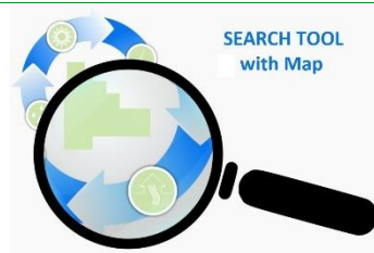
Search for recycling and disposal options on willcountygreen.com