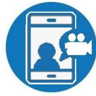
Take a Virtual Tour