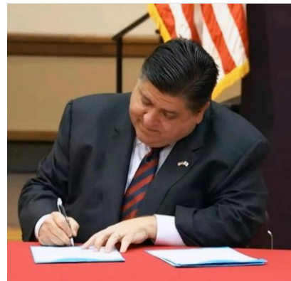
Senate Bill 836 signed into law after passing unanimously in the House and Senate in May