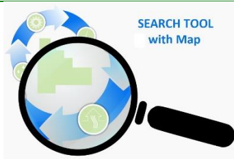
Search for recycling and disposal options on willcountygreen.com