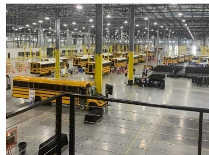
Electric School Buses inside Lion