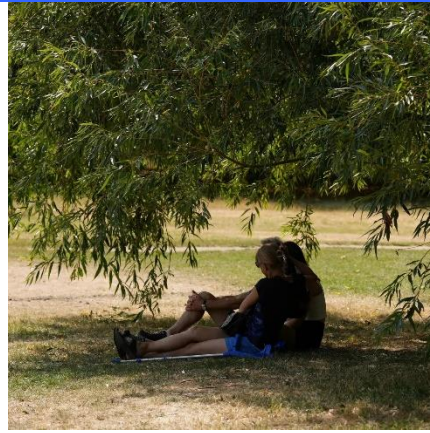
Shaded areas may be up to 10 degrees cooler.