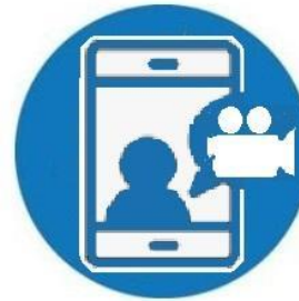
Take a Virtual Tour