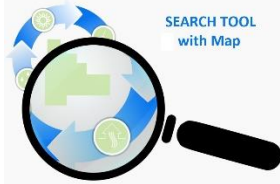
Search for recycling and disposal options on willcountygreen.com