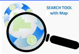
Search for recycling and disposal options on willcountygreen.com